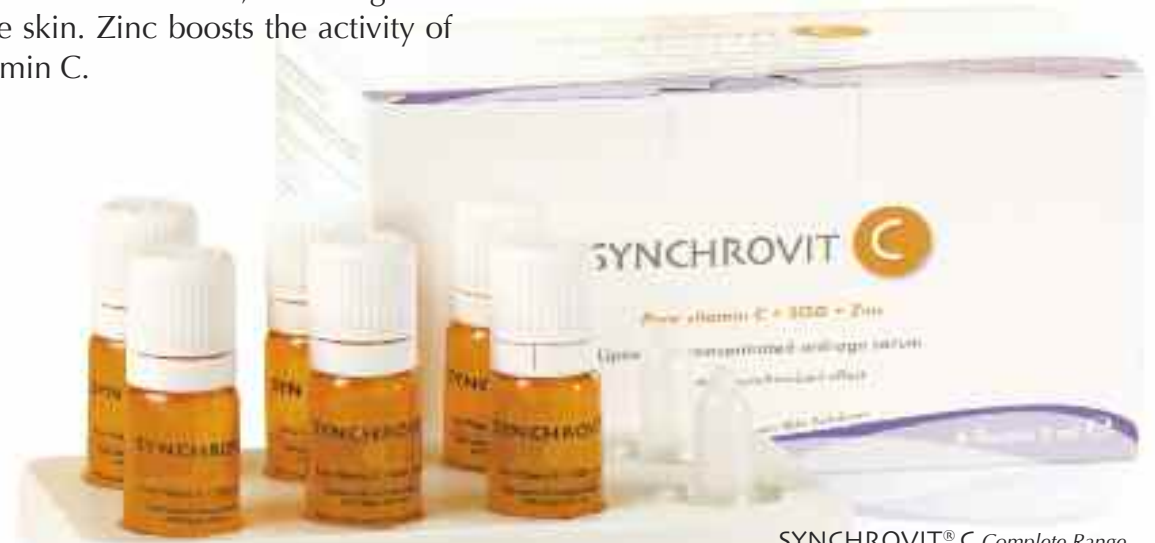
SYNCHROVIT® C Complete Range